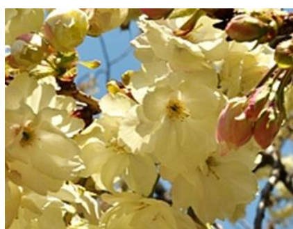
Yellow cherry blossoms (Ukon)