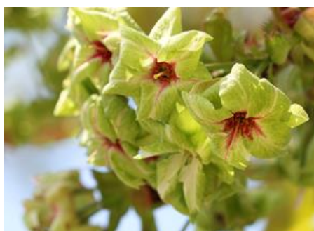
Green cherry blossoms (Gyoikō)